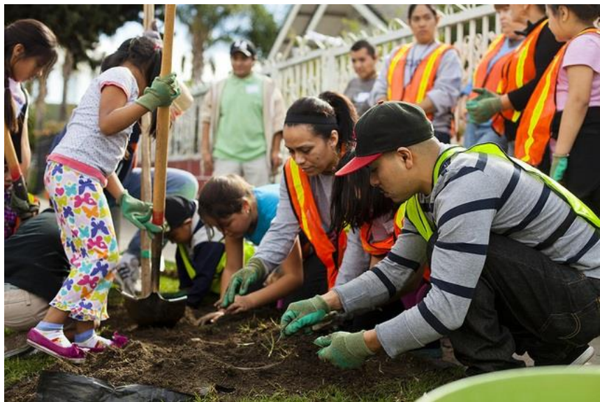
Koreatown Youth and Community Center