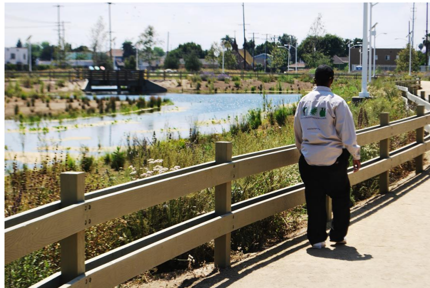
South Los Angeles Wetlands Park